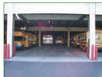
40' Column Spacing