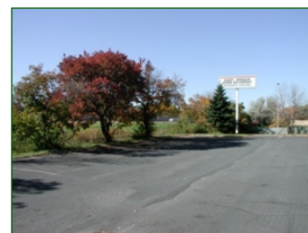
Lighted, Signed I-694 Frontage