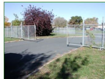
Security Fence w/Gate