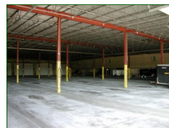
18'+ Clear Height