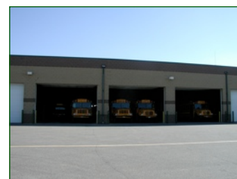
40x26' Column Spacing