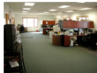
6,003 Sq Ft Office Space